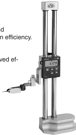
Shown with 192-008 Probe