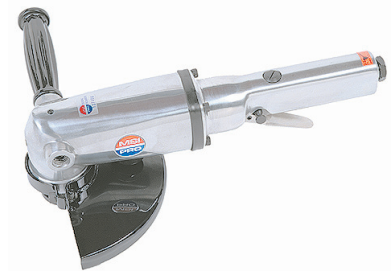
10013 7" Angle Grinder