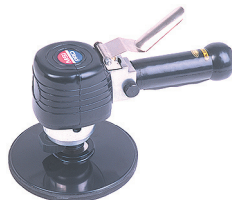
16013 6" Dual Action Sander