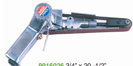
9916026 3/4" x 20 -1/2" Mini Belt Sander