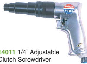
14011 1/4" Adjustable Clutch Screwdriver