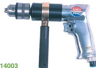
14003 1/2" Reversible Drill