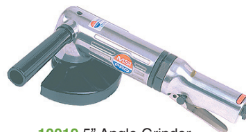
10019 5" Angle Grinder