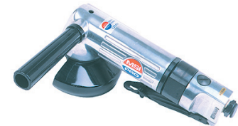
9910012 4" Angle Grinder