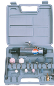
9918008 1/4" Die Grinder Kit