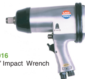
15016 3/4" Impact Wrench