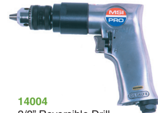
14004 3/8" Reversible Drill