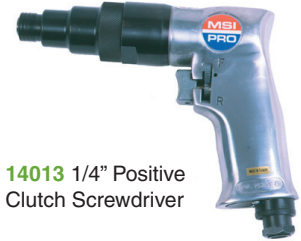
14013 1/4" Positive Clutch Screwdriver