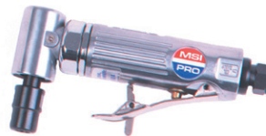
9910007 1/4" Angle Die Grinder