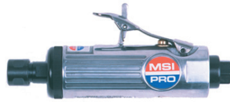
9010025 1/4" Die Grinder