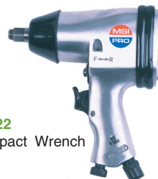
9915022 1/2" Impact Wrench