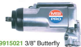
9915021 3/8" Butterfly Impact Wrench